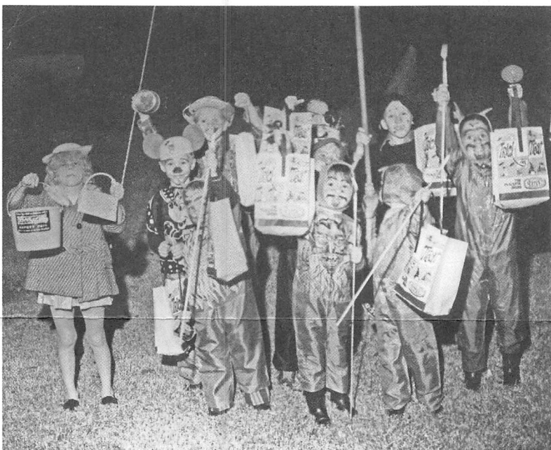
Boys Ranch 1971 Halloween

These men and women meet via conference calls about 8 times a year at regular or special called meetings. Each serves on at least one of the 6 standing committees and the committee chairpersons and officers make up the Executive Committee. This Association has grown a lot and does much on behalf of all alumni of BR and GT. They are your contact persons for suggestions, questions and even criticisms that would help your Association do good work. Lift them up!