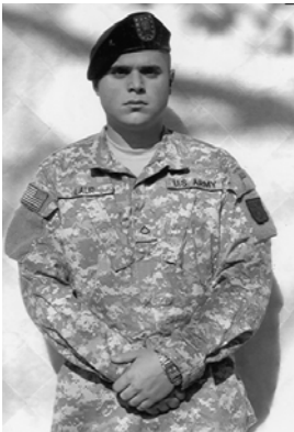
Chrysler Laur (03) Currently in Kuwait